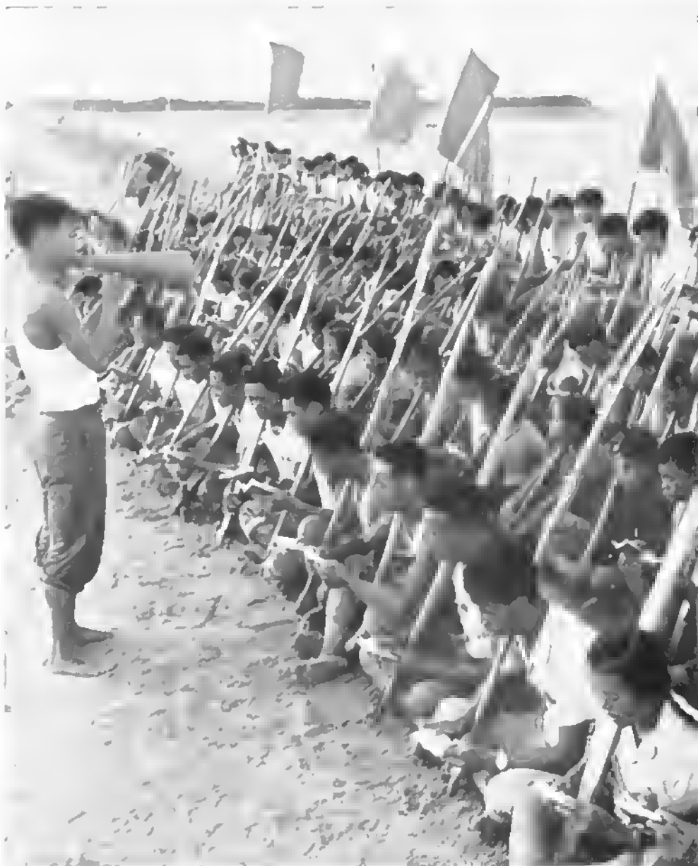
Militia fighters studying Chairman Mao's quotations during a work break.

Peipu Gulf is a natural fishing ground teeming with marine life. People in the communes on the coast of the Kwangsi Chuang Autonomous Region have always fished there. However, U.S. imperialism, warring against Viet Nam, continues to provoke and attack Chinese fishing boats in the gulf with planes and warships, creating one bloody incident after another. But Chinese fishermen armed with Mao Tsetung Thought cannot be intimidated. Fearing neither hardship nor death, they fight back blow-for-blow with a thorough revolutionary spirit.